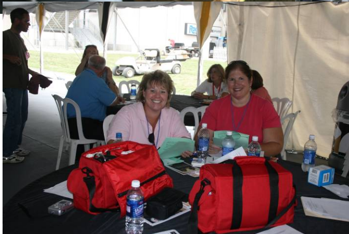
(Continued from page 1, Leadership Volunteer)