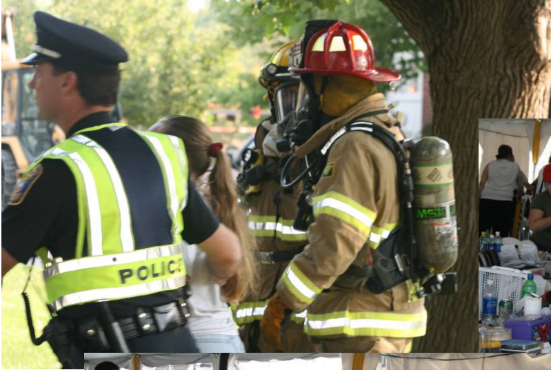
More photos from the September 6th Franklin County Full-Scale Exercise